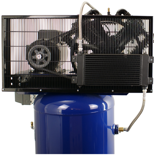
BGAC1M belt guard aftercooler mounted.

WE HAVE A FULL LINE OF FACTORY MOUNTED OPTIONS. WITH FIELD MOUNTING KITS AVAILABLE FOR OUR BRAND OR ANY BRAND AIR COMPRESSOR.